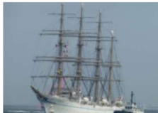
Kobe Port 150th Anniversary