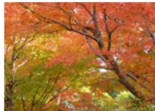
Autumn at the Chishakuin Temple, Kyoto