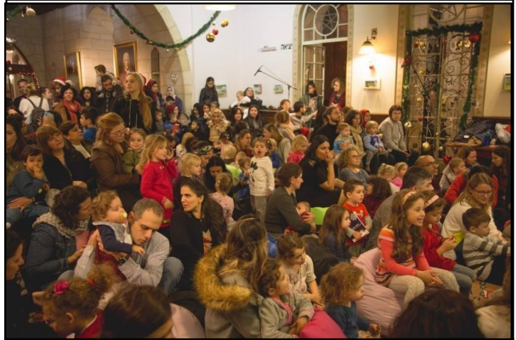
Parents and children gather to share holiday blessings in the YMCA lobby.

Wishing all our friends in WFYR a Happy New Year from the Jerusalem International YMCA