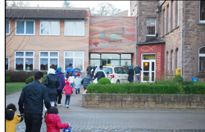
The first new home: The CVJM House Roma

The "new" in Germany and the YMCA challenge is to think anew about how we can fulfill our mission as the YMCA. We want to reach out to all young people. We want to speak of our faith in an