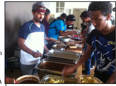
Refugees help prepare dinner

The Reformation camp was a particularly impressive camp. It took place in Wittenberg in the 500th anniversary year of reformation in 2017. More than 180 young people from 25 countries, refugees and young people from the international partner YMCA spent 10 impressive days together. They experienced "a piece of heaven on earth."