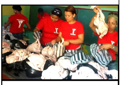
Meals prepared for friends in the Dominican Republic

AYR is about reminiscing, caring about each other's valleys and mountain-tops in life, just plain laughter and joy with whatever we're