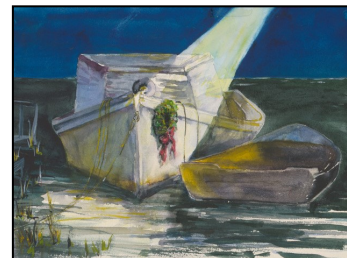
"A Light Shines in the Darkness"

Bridges will continue to provide glimpses into the life and legend of Sir John R. Mott and share news as the concept of providing Ambassador support to visiting Y retirees in various locations around the world continues to gain support and enrollees.