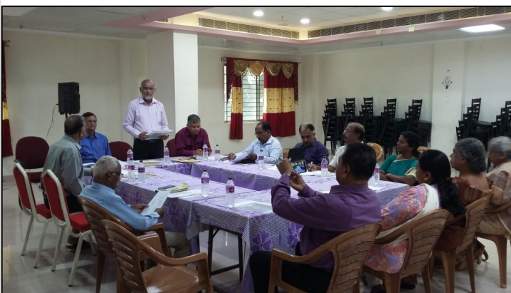
Members of the Silver Jubilee Planning Committee