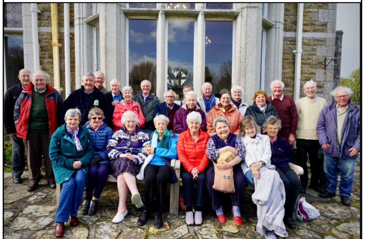
A large group of Y's retirees enjoyed the 2019 week at Trelohan Manor St. Ives, Cornwall. A film, quiz and mystery tours added to fun, and the good food enjoyed with friends was followed by nightly prayers and communion before departures.