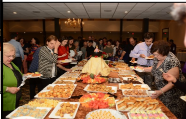
The program ended with the sharing of delicious Armenian food.