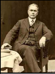
John R Mott