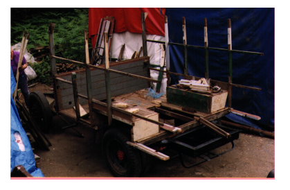
A BIT OF A CHALLENGE!