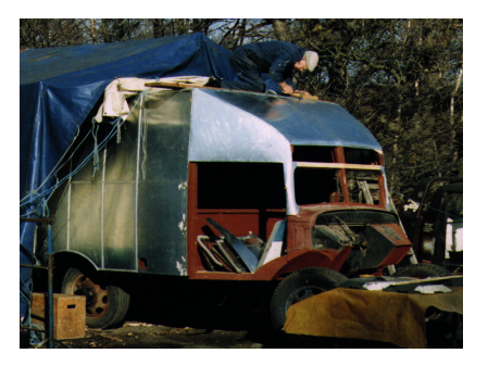
PUTTING ON THE NEW ALUMINIUM BODY