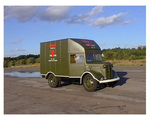
BERTHA FINISHED AT BROOKLANDS.