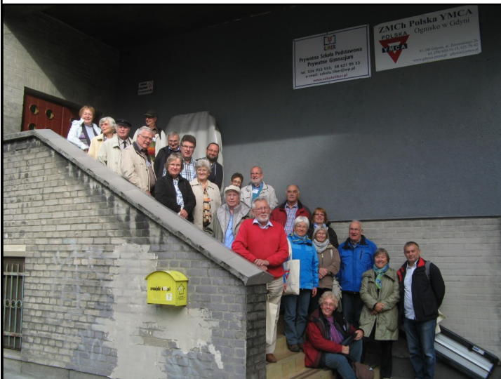
YMCA of Poland in Gdynia