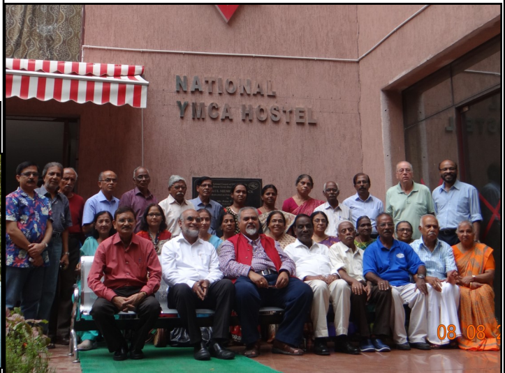
The 20th Annual Conference of the India Fellowship of YMCA Retirees was held in New Delhi in August