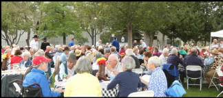
Above: National Reunion participants gathered for a meal, fellowship and lively entertainment on the grounds of the Nevada governor's mansion.