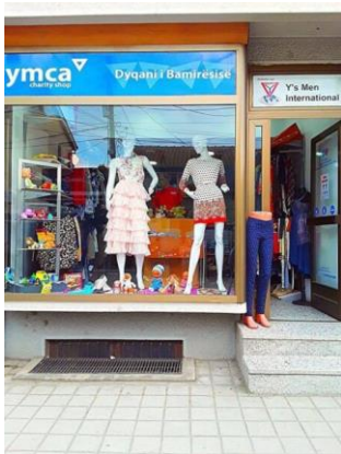
One of the projects of Y's Men: a charity shop in Kosovo