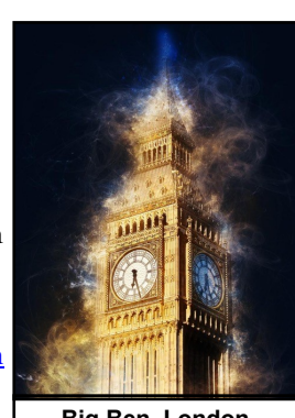
Big Ben, London