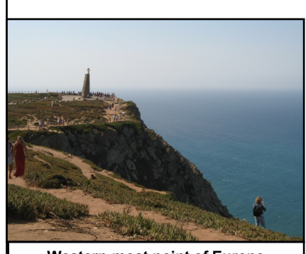
Western-most point of Europe

After we - the seniors of CSI - have already been to eleven different capitals of Europe, it was time to push forward to the southern border of Europe. Lisbon, the capital of Portugal was our destination for six days. We have not only been very far in the south, we have also