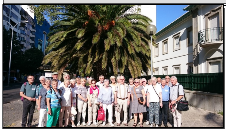
The Seniors of CSI

After we - the seniors of CSI - have already been to eleven different capitals of Europe, it was time to push forward to the southern border of Europe. Lisbon, the capital of Portugal was our destination for six days. We have not only been very far in the south, we have also