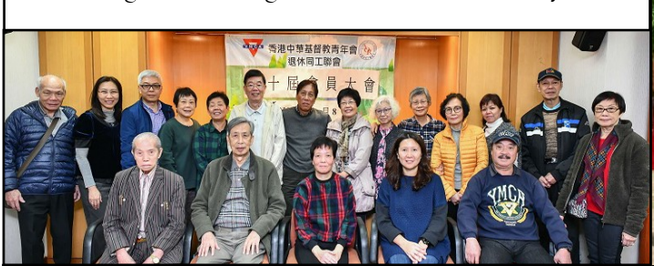
2018 Committee Inauguration